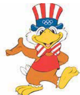
1984 Los Angeles