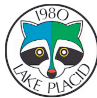
1980 Lake Placid