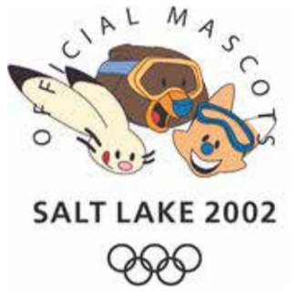
2002 Salt Lake City

Designer: Spyros Gogos, Paragraph Design